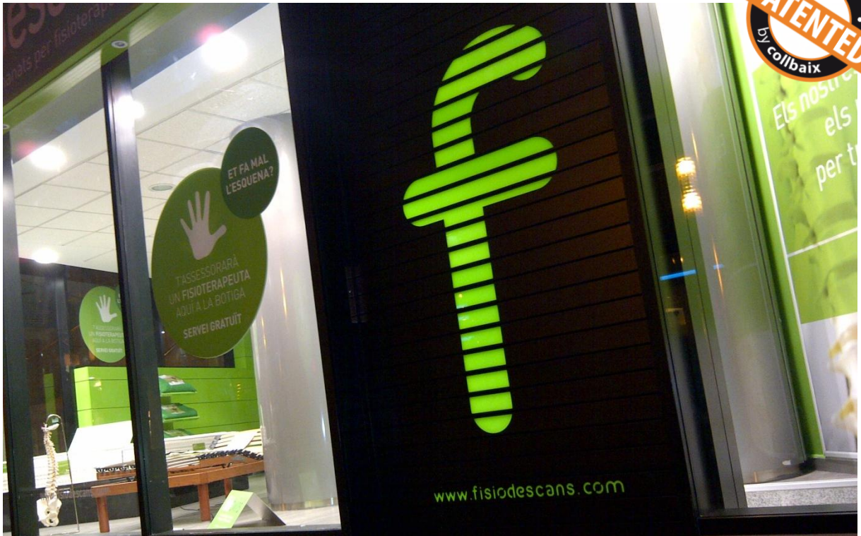
MASTER DEKORA model in 9011 RAL