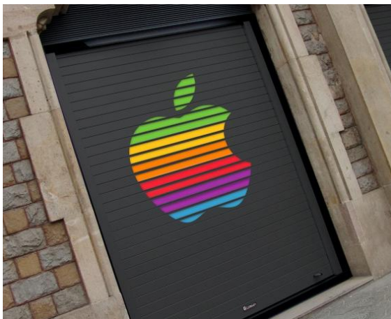
MASTER DEKORA model in 9011 RAL

DE TURN YOUR ROLLER SHUTTER KO IN A UNIQUE AND INNOVATIVE RA MARKETING AND COMMUNICATION TOOL